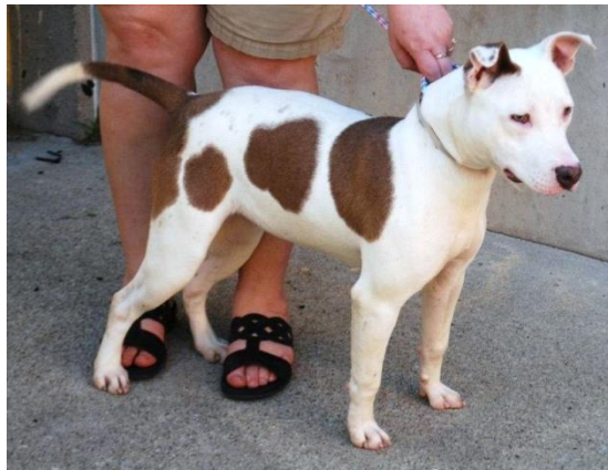
This dog is alert. She may want to go check something out or she may want to challenge another dog. Be careful when you see a dog looking like this.