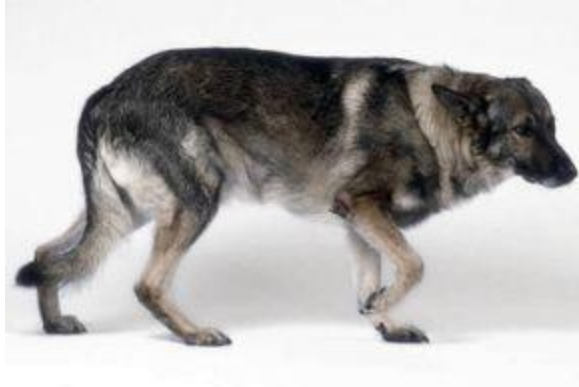
This dog is scared too!